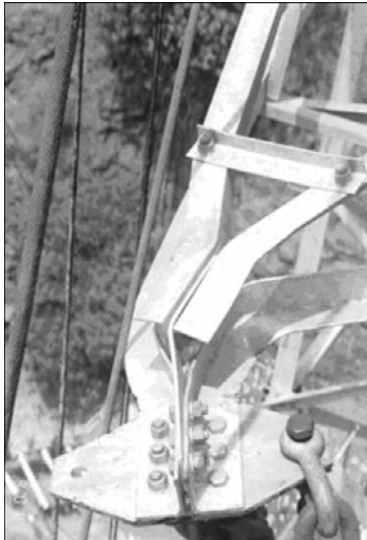
TEST – Failure of Cross Arm Tip