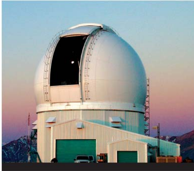
SOAR Observatory – Cerro Pachon, Chile